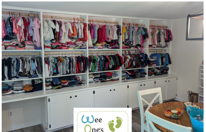
Grand opening in May of 2023

It has been a long-term goal of Path to expand our reach by providing pregnancy related services in areas outside of the Treasure Valley as well. We were able to partner with a lady in Horseshoe Bend who had a similar vision of offering services in her community. We were granted access to rooms in a medical building right in the middle of the town. The office space had not been utilized for many years, and it was evident that it would need to be updated before we could offer services. But God wasn't done yet! First, the building's Board authorized some basic repairs and work to be done at no cost to Path. Then a couple from the community stepped up and donated their time, resources, and expertise to completely renovate one room to be used as a baby boutique. They painted, put in new floors, furnished, decorated, and completely revamped the space making it not only functional, but truly beautiful! Shortly after this we recruited and trained several new volunteers to set up and staff the boutique. We named it Wee One's Wardrobe and it officially opened in May of 2023. In addition, we partnered with All Baby! Ultrasound to start offering services in Nampa one day a week. We are humbled and grateful to be part of this whirlwind of events that happened in 2023, which only God could have orchestrated.